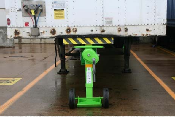
WIRELESS INTEGRATED TRAILER-JACK WIT-J