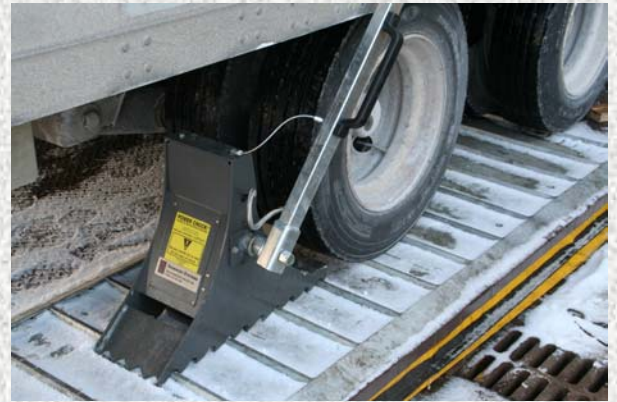
WHEEL FOCUSED TRUCK RESTRAINT