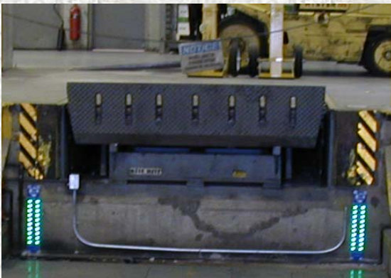
DOCK LEVELER WITH GUIDE LIGHTS