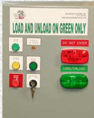
Loading Dock Safety Systems Combination Control Panel UIDSS