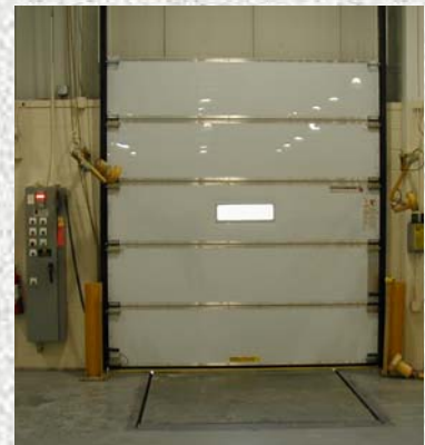
IMPACT ABSORBING LOADING DOCK DOOR

Our Universal Integrated Dock Safety System* (UIDSS) can be configured to include the WIJ-T. This system provides the safest loading dock system possible. By forcing sequential operation, the WIJ-T and trailer restraints must be in place before the dock door or dock leveler can be used. We specifically designed this system to monitor itself and protect against human error providing the highest degree of protection for employees and equipment.