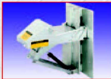
Available TRUCK-LOCK™ Safety Systems