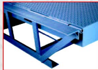
Full Width Rear Hinge