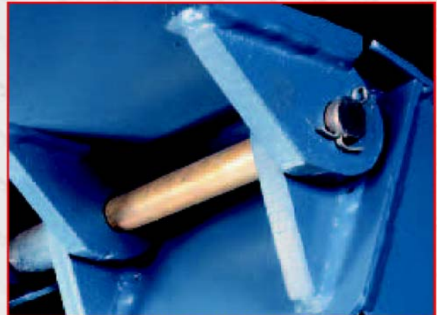
EXCLUSIVE LIP LUG & HEADER PLATE DESIGN